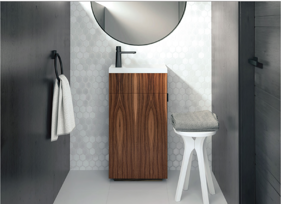
The minimalist design of the Stellé pedestal in walnut fits easily into any powder room or bathroom, no matter its size.

most popular shade but we’re seeing more grey and black tones, which we’re coming out with in 2022: a new slate colour and a new grey colour for our fixtures,” says Wolinsky. “On the furniture side, we’ve introduced a new pacific blue lacquer, which is a rich, beautiful colour that matches up perfectly with walnut, oak and other wood finishes.” Wetstyle is currently working on releasing a new collection inspired by the Bauhaus movement and the White City of Tel Aviv, which has thousands of Bauhaus buildings, as well as developing new methods and tools to help with the labour shortages and manufacturing delays associated with the pandemic, which are ongoing. “It was difficult manufacturing in Quebec before the pandemic and now it’s become extremely challenging,” Wolinsky says. “We’re looking at bringing in tools like artificial intelligence to help us address those challenges.”