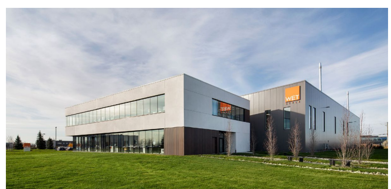
Wetstyle headquarters in Saint-Bruno-de-Montarville's industrial ecopark.