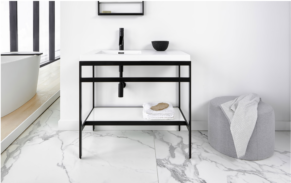
The C collection console is inspired by minimalism and made of stainless steel.

“SOME SEARCH FOR HAPPINESS. I’VE FOUND MINE.”