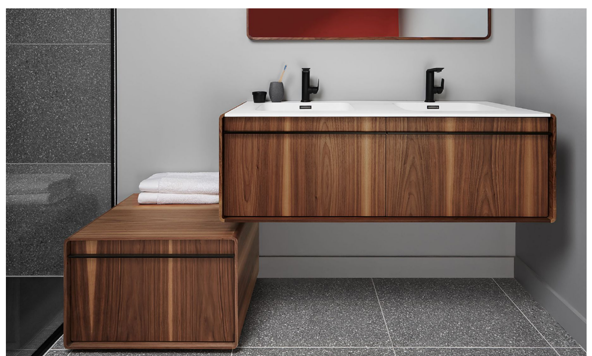
The freestanding Deco vanity was inspired by Art Deco and features flowing, rounded curves.