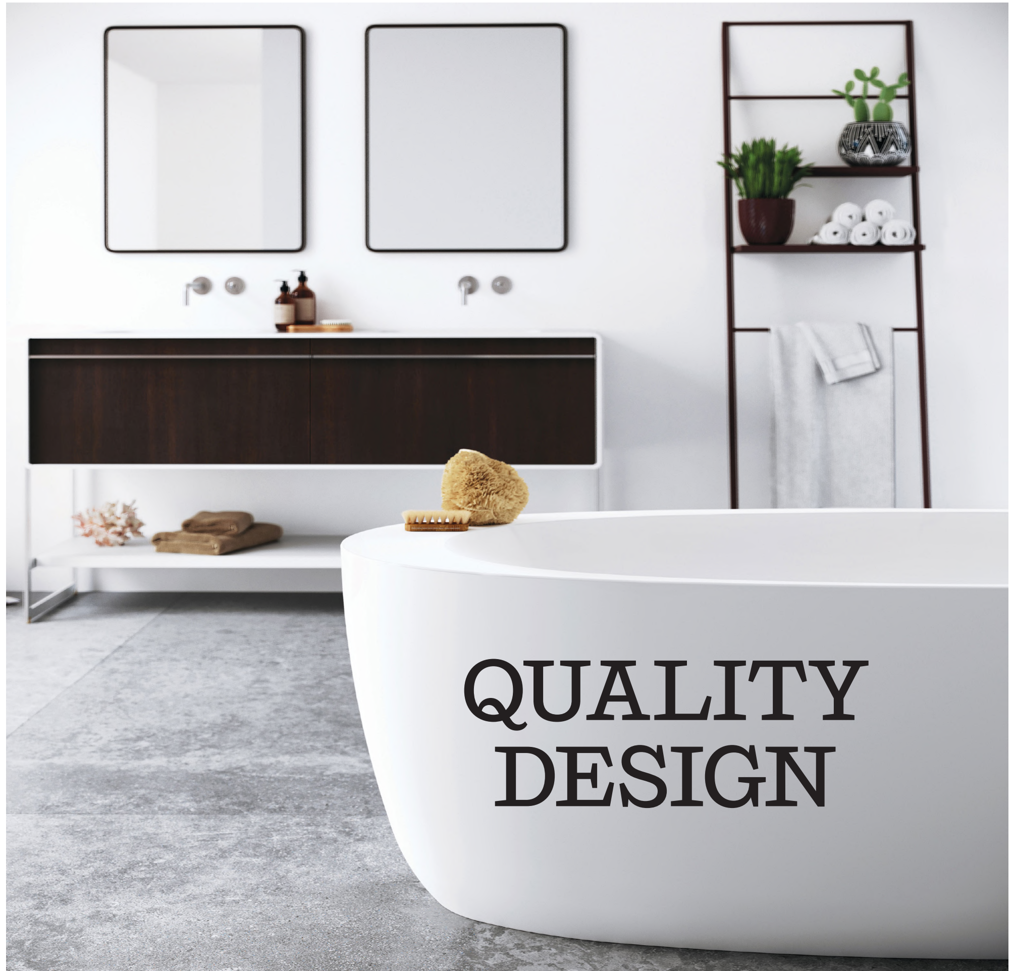
Winner of the Industrial Design - Bathroom Product Award at the 2020 Grands Prix du Design, the Mood soaking tub adds function to relaxation with a side rim storage shelf that blends into the tub and infuses a spa-like feel into home bathrooms.