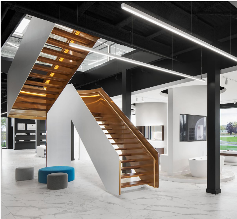
The 11,600 sq. ft. showroom was awarded the best showroom design prize by the 2020 Grands Prix du Design.