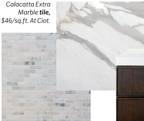
IM Mini Brick Carrara tile , $30/sq.ft. At Saltillo Imports.