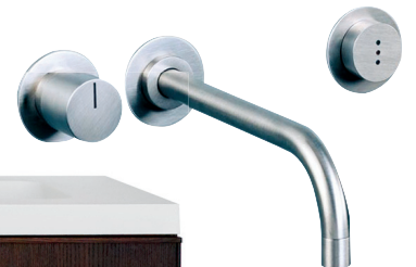
4121 Electronic faucet by Vola, $5,035. At Ginger's.