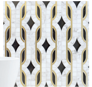
Dundass Grande mosaic tile by Mosaïque Surface, from $266/sq.ft. At Surfaces & Co.