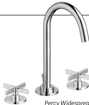
Percy Widespread faucet with Cross Handles by DXV, $673. At The Water Closet.