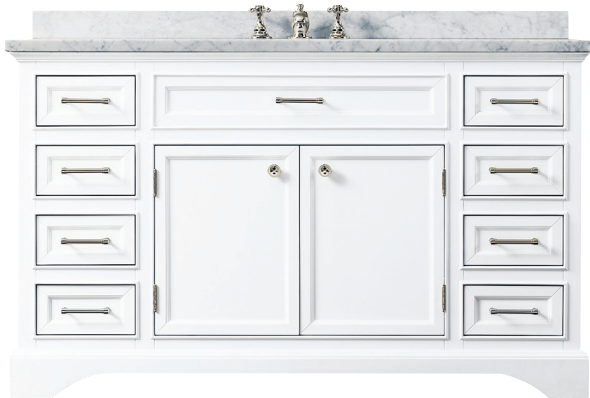
Kent Single Extra Wide vanity , $4,496. Through RH.