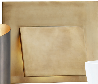
Esker Envelope sconce by Kelly Wearstler for Visual Comfort, $473. Through Prima Lighting.