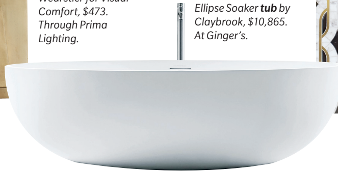
Ellipse Soaker tub by Claybrook, $10,865. At Ginger's.