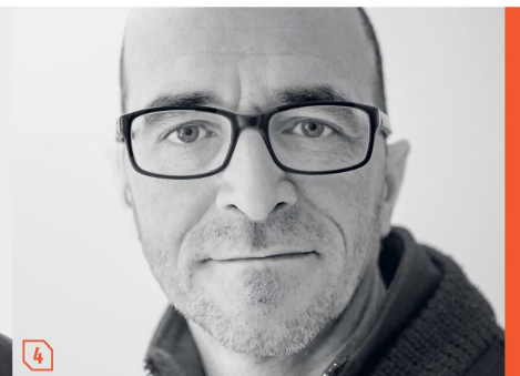
Pierre Bélanger for Wetstyle

product Mood standout Offset ellipses distinguish this shapely tub made of robust and nonslip Wetmar Bio, a thermo-insulating eco-material that can be specified in a gloss or matte finish. wetstyle.com