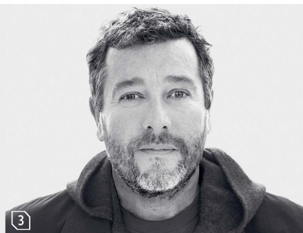
Philippe Starck for Duravit

product Starck Barrel standout New finishes such as Night Blue lacquer and real wood veneers are now on offer for the design star's first ever bathroom product, a vanity inspired by the most minimal bathing elements: a bowl, bucket, and hand pump. duravit.us